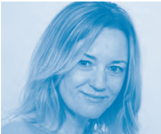
TV Current Affairs

I am head of the Radio Current Affairs department for the BBC, based in London and Salford. I began my career in local radio in Liverpool, spent three years at a newspaper in Tokyo before returning to the BBC, working in daily radio journalism then moving to current affairs. I fell in love with radio documentaries and have stayed in this department pretty much ever since – presenting, producing and editing long-form radio. I currently edit the Analysis series and the Reith Lectures, working with among others Stephen Hawking and Hilary Mantel. We also make online text and video and produce some of the UK's most popular podcasts.