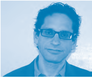
Radio Current Affairs