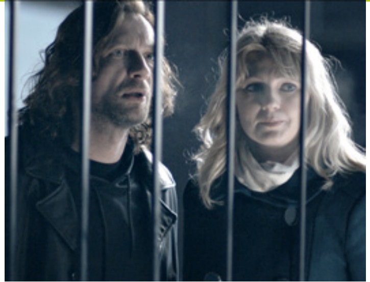
Alamaailma (Underworld Trilogy), 2011 – Production Company: Vertigo Oy