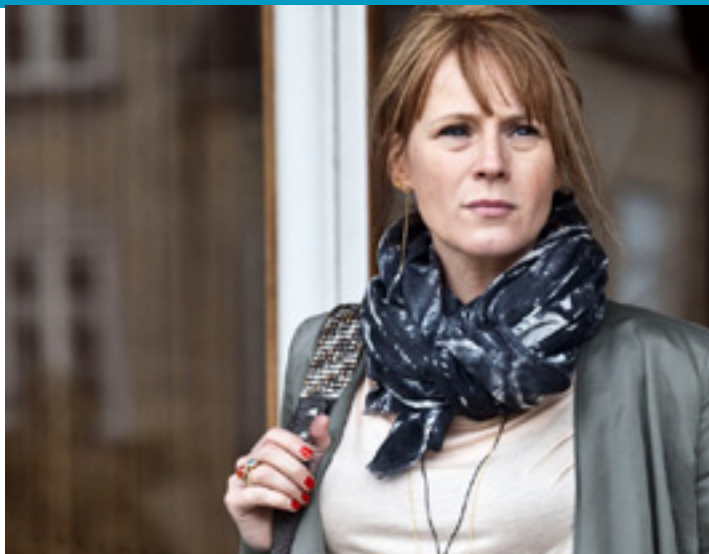
Dicte, 2013. TV2