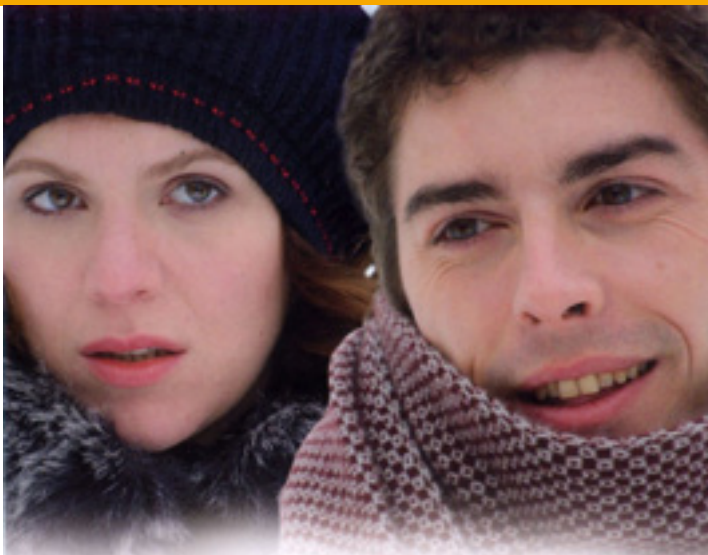
Dieci Inverni , 2009 – Production Company: Raicinema