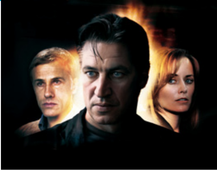
Das Jüngste Gericht, (The Last Judgement), 2007 – Production Company: Lisa Film