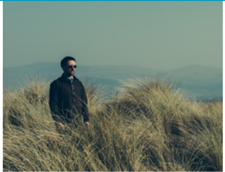
Hinterland , 2013 – Production company: Fiction Factory