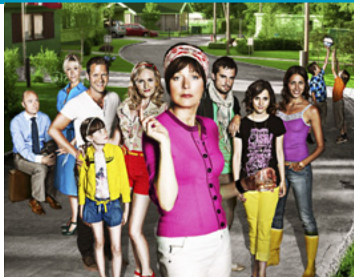
Lærkevej (Park Road), 2009. Production Company: Cosmo Film