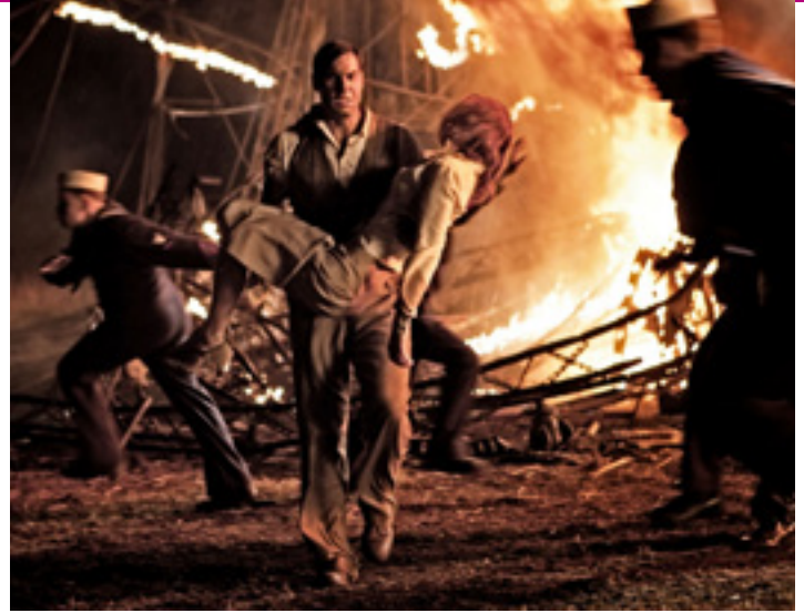
Hindenburg , a TV movie in two parts. Production company: teamWorx 2011 (supported by the MEDIA TV Broadcasting scheme).