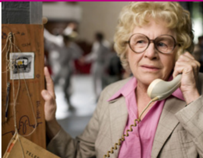
Annie MG , 2009 – Production Company: BosBros, with co-producers the broadcasters VRT, VARA & NPS