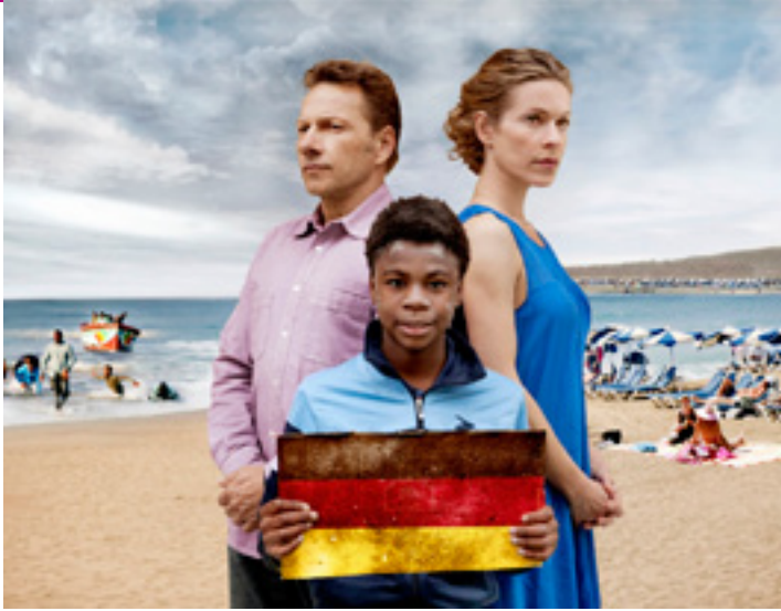
Welcome to the Club , 2013 - Production Company: Hager Moss Film (supported by the MEDIA TV Broadcasting scheme)