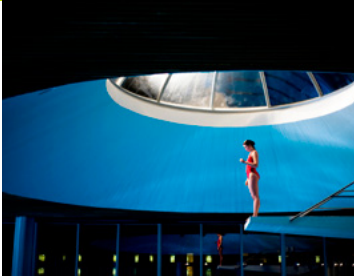
Jälkilämpö, (Latent Heat), 2009 – Production Company: Kinotar Oy