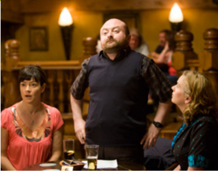
Trivia , 2010 – Production Company: Grand Pictures. Developed with the support of the MEDIA Slate Funding scheme.