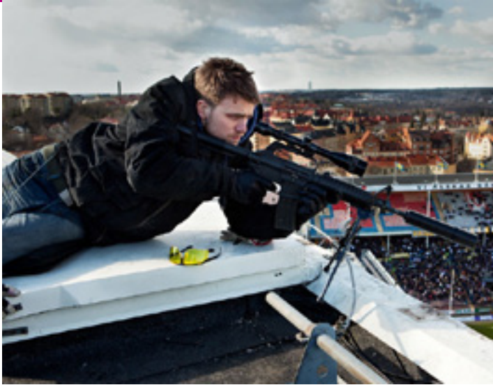
Drottningofret (The Sacrifice), 2010 – Production Company: Bob Film.