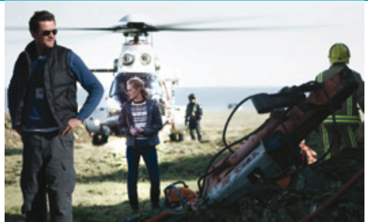
Both of these images are from The Cliff (Hamarinn) , 2009. Production Company: Pegasus.