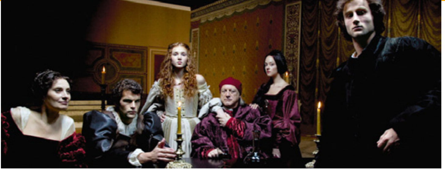
Borgia . Produced by Canal+, Atlantique and EOS with the support of the MEDIA TV Broadcasting scheme.