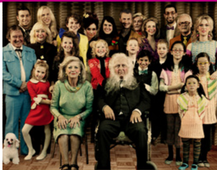
Het Gordijnpaleis van Ollie Hartmoed produced by Lemming Film co-produced by Willy Waltz (NL), A Private View (BE) and broadcaster VPRO, VRT. Developed with the support of the MEDIA Programme (Slate Funding). Released December 2011