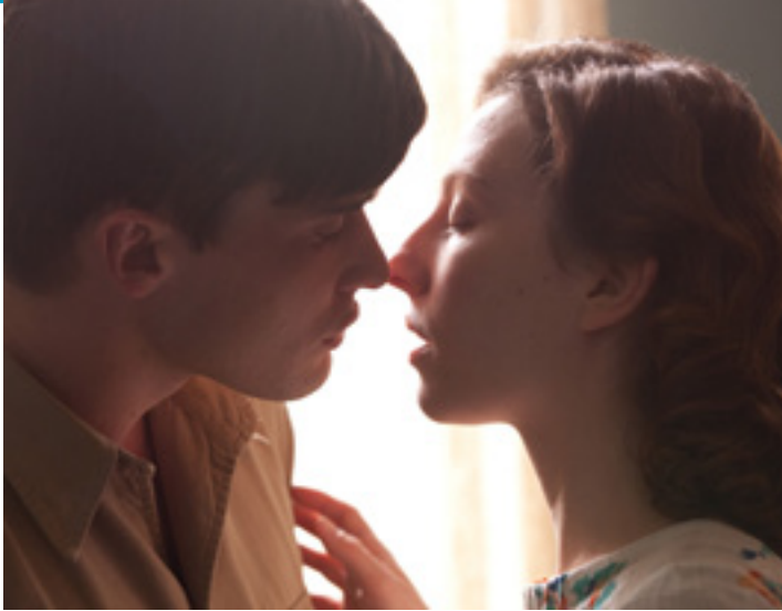
The Promise , 2011 – Production Company: Daybreak Pictures