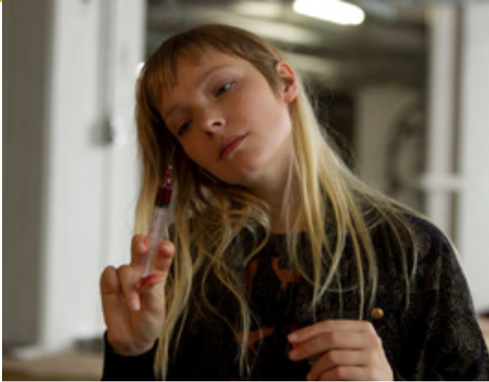
The Spiral . Produced by Caviar, Belgium. Developed with the support of the MEDIA Interactive support scheme.