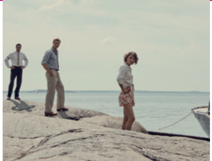
Death of a Loved One 2013 - Production Company: Pampas Produktion (supported by the MEDIA TV Broadcasting scheme) (Photo: Svensk Filmindustri).