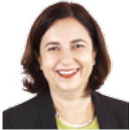
The Honourable Anastacia Palaszczuk MP, Premier and Minister for the Arts