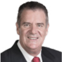
The Honourable Mark Furner MP, Minister for Local Government and Minister for Aboriginal and Torres Strait Islander Partnerships