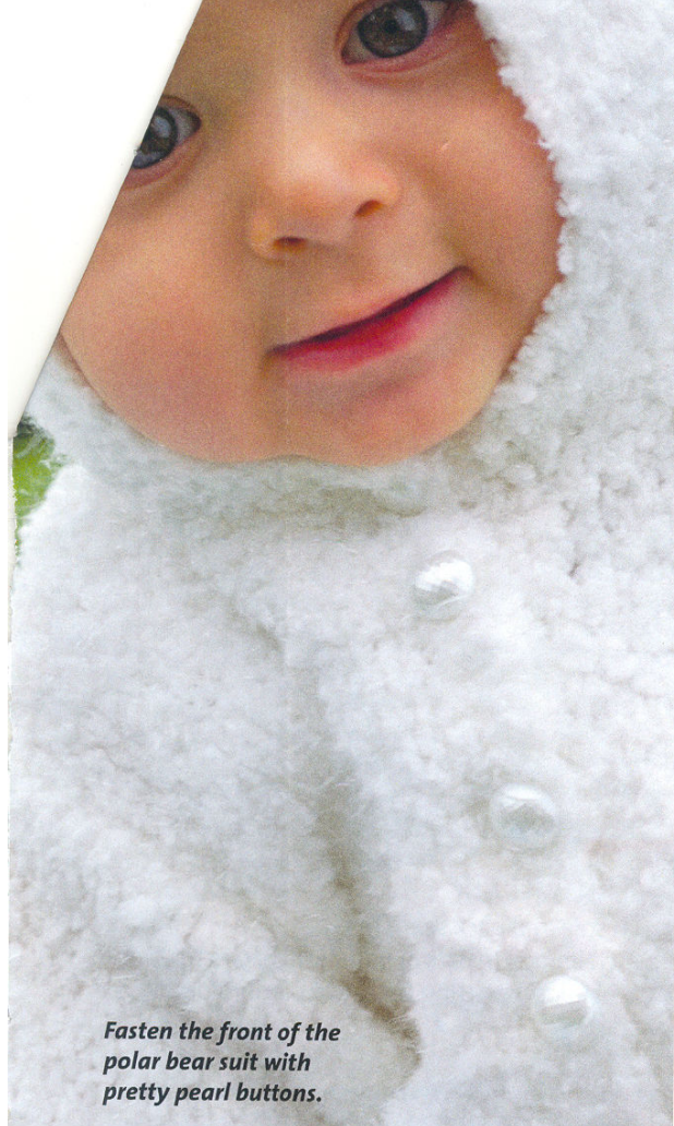
Fasten the front of the polar bear suit with pretty pearl buttons.

Cont straight until work meas 17¼ (18½: 20½)in, 44 (47: 52)cm from cast on edge, ending at armhole edge.